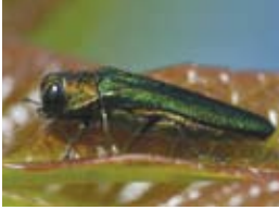
EAB adults must feed on foliage before they become reproductively mature.

effective pheromone traps for EAB. However, first emergence of EAB adults generally occurs between 450-550 degree days (starting date of January 1, base temperature of 50°F), which corresponds closely with full bloom of black locust ( Robinia pseudoacacia ). For best results, consider two applications, one at 500 DD 50 (as black locust approaches full bloom) and a second spray four weeks later.